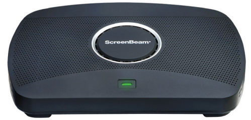
CATALOG NUMBER SBWD1100P ScreenBeam 1100 Plus Wireless Display Receiver with ScreenBeam CMS

When only wireless presentation is required, ScreenBeam provides app-free agnostic support for Windows, Apple and Chromebook devices. Users simply tap once to wirelessly present and markup content on in-room displays from their own device. It's easy to connect both employees and guests with three separate network interfaces that keep guests off the company network. Administrators can breathe easy with three levels of security covering every point of the connection and included ScreenBeam CMS Enterprise multi-user, role-based monitoring and management solution.